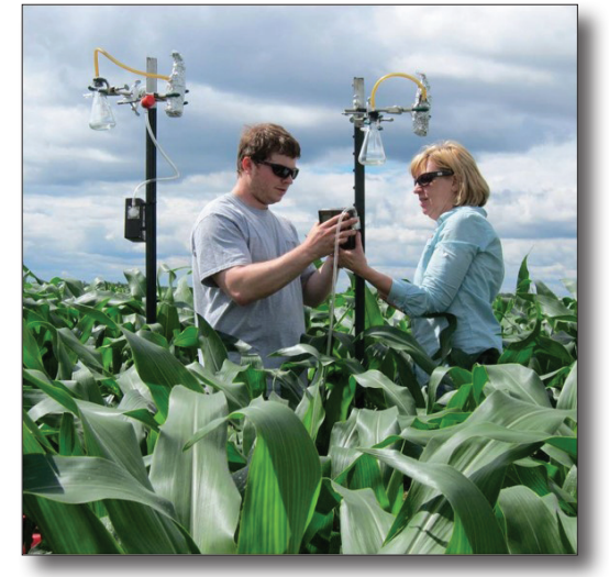
Setting up the equipment in the field to measure microorganism transport during irrigation.

Also, it is important to recognize the risk values reported herein are medians of the risk distribution; users of this report might decide to use lower or higher percentiles of the risk distributions.