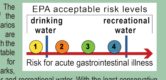
Figure 3. The risk level of the drinking four scenarios water in Figure 2 are compared with the 2 (1 EPA acceptable risk levels for two benchmarks. drinking water and recreational water. With the least conservative

risk scenario (#1), the risk of being infected by pathogens in irrigated manure is just under the accepted risk for drinking water. However, in the most conservative risk scenario (#4), the risk from manure irrigation is close to the acceptable risk level for recreational water. The figure illustrates relative risk and is not drawn to scale.