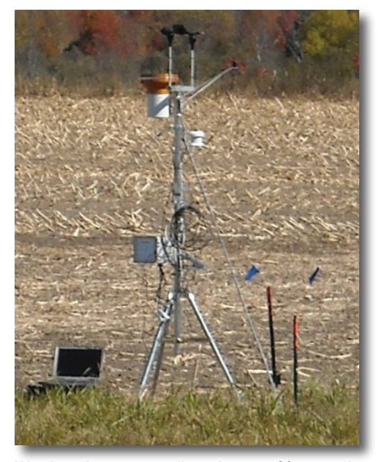
Weather data were collected every 30 seconds during each trial -- wind direction and speed, air temperature, solar radiation, relative humidity, and precipitation, which was always zero.

At the foundation of this effort was an extensive, largest of its kind, field sampling for airborne microorganisms during 23 irrigation events (8 trials by center pivot and 15 trials by traveling gun) in 2012 through 2014. Air samples were analyzed for culturable bacteria in 13 trials and for microorganism genetic markers in 23 trials.